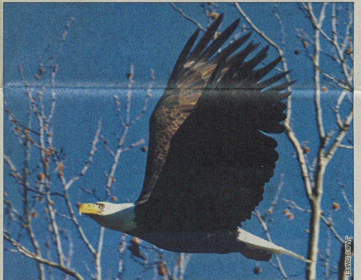
Research indicates bald eagle numbers are on the rise in Texas. This photograph was taken last week near Eagle Lake.